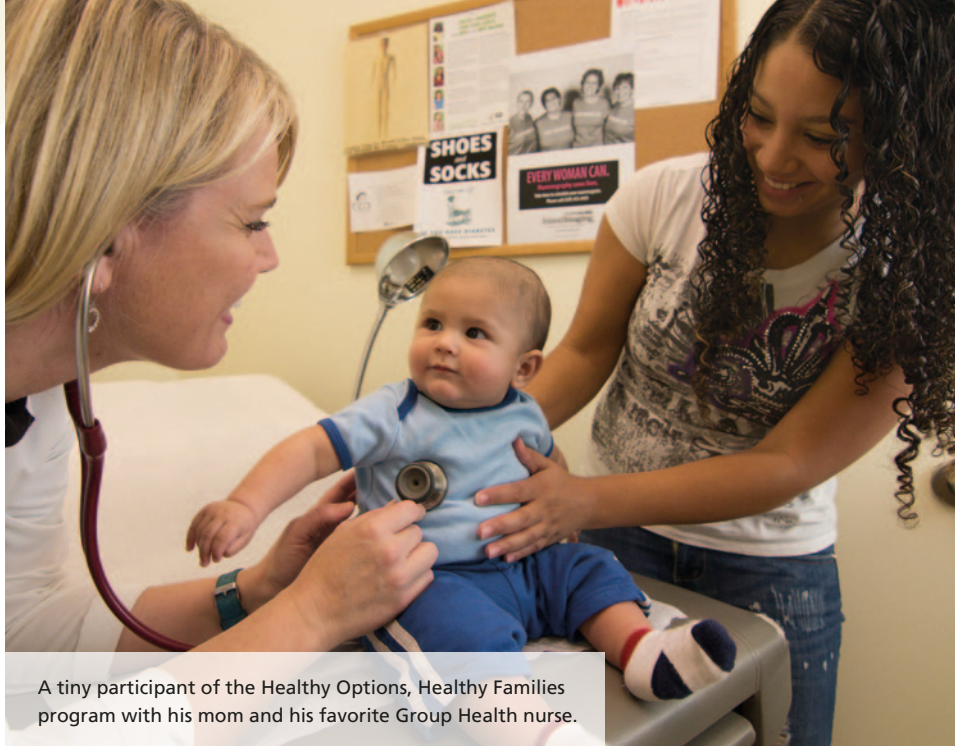
A tiny participant of the Healthy Options, Healthy Families program with his mom and his favorite Group Health nurse.

It begged the question: Is there a way to improve the quality of care for these families and bring down the cost of care for Group Health?