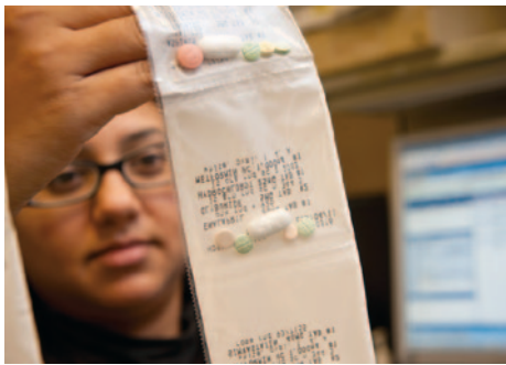
Everything a patient needs to easily manage meds—date, time, and contents.

that puts sets of bar-code verified pills into individual pouches. Each pouch shows the date, time, and contents. The patient receives one month’s worth of pills in one tidy roll.